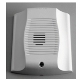
Indoor Wall Horn