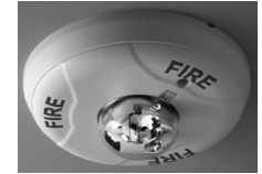
Indoor Ceiling Strobe