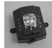
Outdoor Wall Strobe