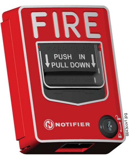
The NBG-12LX Addressable Manual Pull Station